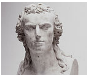
Friedrich Schiller. Bust by Johann Heinrich Dannecker, 1905

Friedrich Schiller is the namesake of the supporting association and the »Schiller Museum« which was founded prior to the establishment of the archive. The historically central holdings of the Marbach Institute stem from Schiller. Though his written estate has been preserved since the year 1889 in Weimar, all manner of written documents from, to and about Schiller were already being collected in Marbach since 1859 on. In the