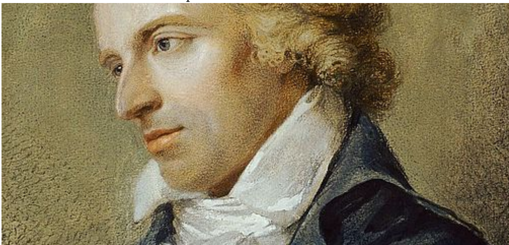
Portrait of Schiller by Ludovike Simanowitz, 1794