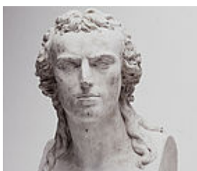
Friedrich Schiller. Bust by Johann Heinrich Dannecker, 1905

Friedrich Schiller is the namesake of the supporting association and the »Schiller Museum« which was founded prior to the establishment of the archive. The historically central holdings of the Marbach Institute stem from Schiller. Though his written estate has been preserved since the year 1889 in Weimar, all manner of written documents from, to and about Schiller were already being collected in Marbach since 1859 on. In the