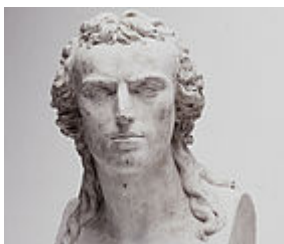
Friedrich Schiller. Bust by Johann Heinrich Dannecker, 1905

Friedrich Schiller is the namesake of the supporting association and the »Schiller Museum« which was founded prior to the establishment of the archive. The historically central holdings of the Marbach Institute stem from Schiller. Though his written estate has been preserved since the year 1889 in Weimar, all manner of written documents from, to and about Schiller were already being collected in Marbach since 1859 on. In the